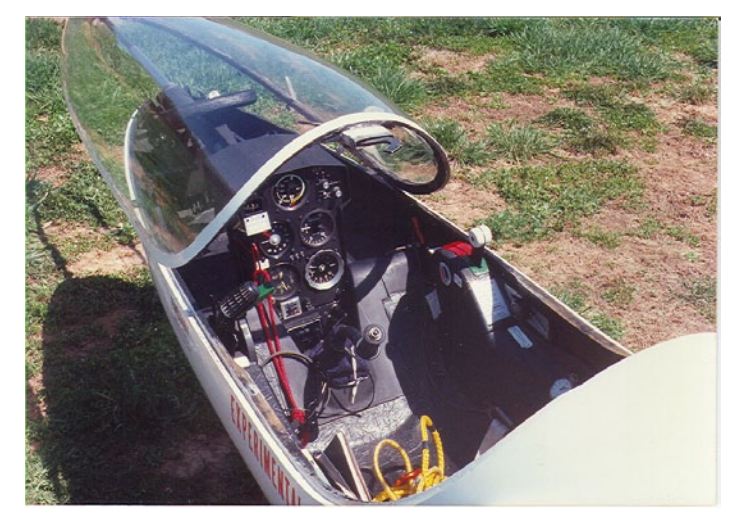
The instrument panel