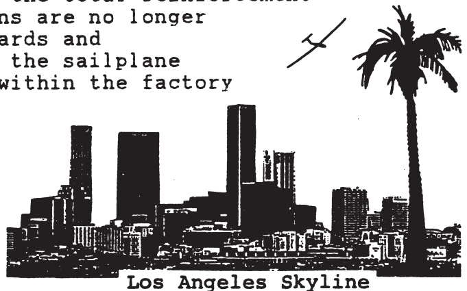
Los Angeles Skyline

These prices may not include the total costs of Inspectors fees or any additional repairs or un-airworthy conditions found necessary to correct during interior wing inspections!. Upon completion of the total reinforcement package, the operating limitations are no longer applicable!. All limitation placards and restrictions will be removed and the sailplane is approved to resume operating within the factory log book limits.