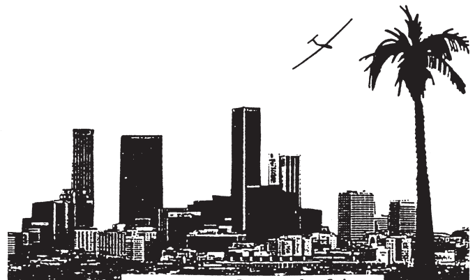
Los Angeles Skyline